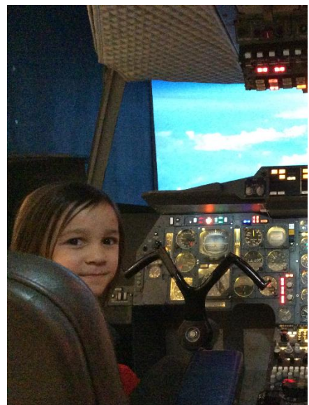
Winter and Spring Classes had a great time at the Aerospace Museum