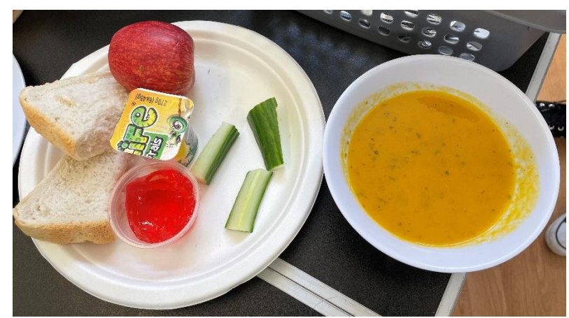
Soup and Sandwiches