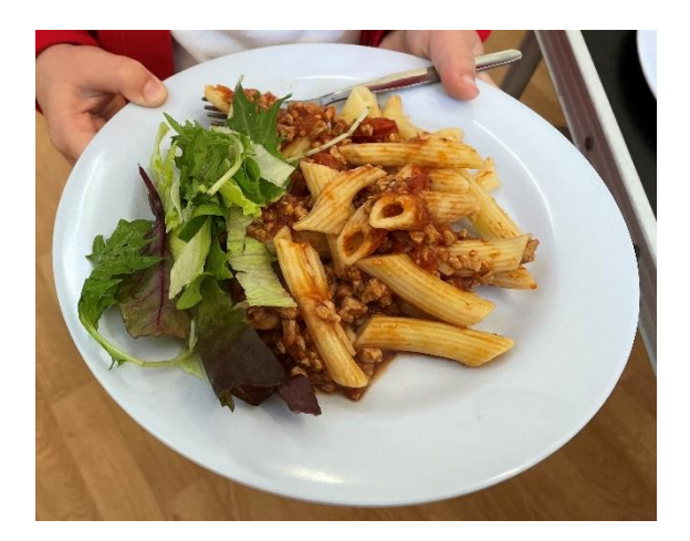
A selection of Vegetarian Options