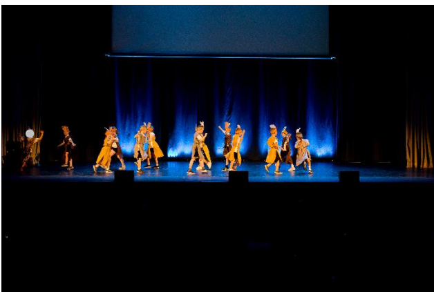
Year 2 performing at the Acorn Dance Festival at The Forum in Bath