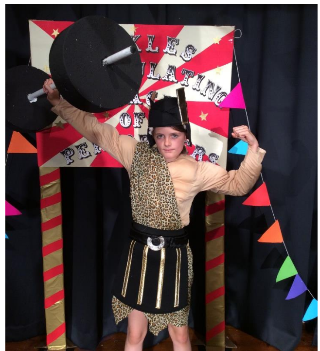
Years 5 and 6 preparing for their performances of 'The Greatest Show'