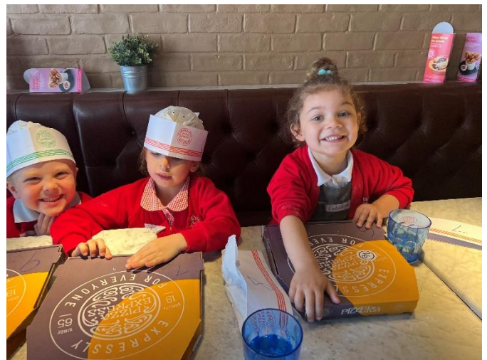
Winter Class having a fun time on their trip to Pizza Express